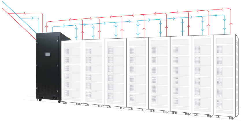
Row Level Configuration

Optimized for space claim, serviceability, efficiency, and performance, the CDU can deliver up to 1MW of capacity and be positioned in the server rows, at the facility's perimeter, outside the white space, or in a facility room – via slab or raised floor.